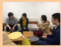
Things International students think they lack when hunting job in Japan