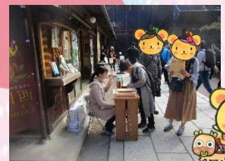
In Kiyomizu temple