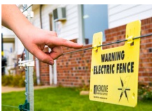
The Times Weekly