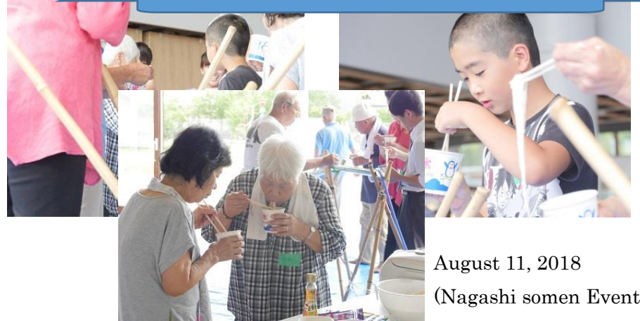
August 11, 2018 (Nagashi somen Event)

We had about 100 guests from elderly to children.