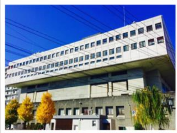
Nagasaki City Gender Equality Promotion Center

How do you want people to receive the CPA?