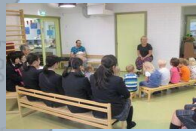
↑Tonttula nursery school

In Finland, the government is closely connected with NGO/NPOs and private sectors.