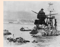
The Pearl Harbor Attack