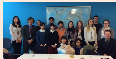
United Nations Office for Disarmament Affairs

PDF files of the book on the WEB of the UN