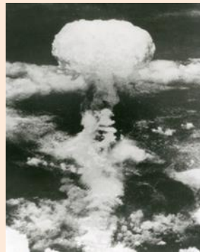
The Nagasaki Atomic Bomb

Q2: Can you explain all of these facts deeply?