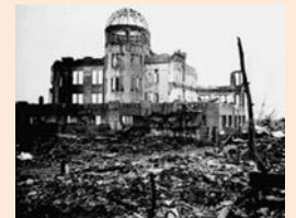
The Hiroshima Atomic Bomb